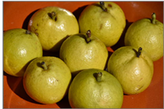
Golden Spice Pear fruit