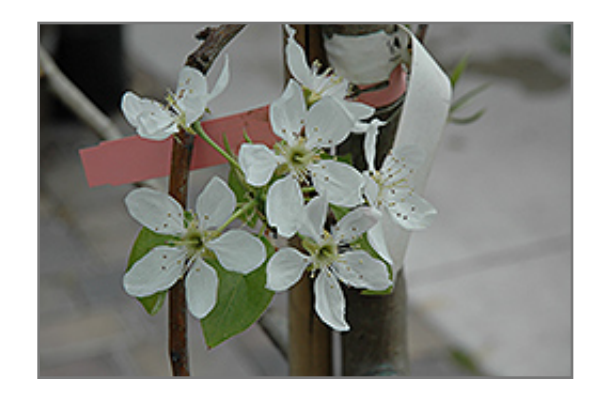
Bosc Pear flowers