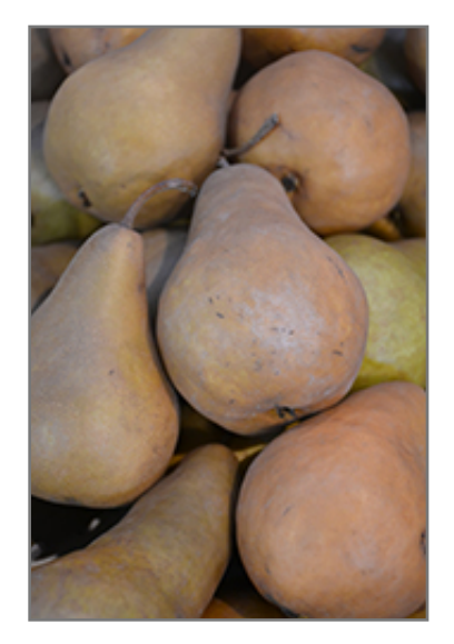
Bosc Pear fruit