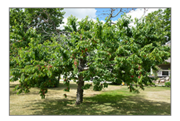
Bing Cherry fruit

This is a deciduous tree with a shapely oval form. Its average texture blends into the landscape, but can be balanced by one or two finer or coarser trees or shrubs for an effective composition. This plant will require occasional maintenance and upkeep, and is best pruned in late winter once the threat of extreme cold has passed. It is a good choice for attracting birds to your yard. Gardeners should be aware of the following characteristic(s) that may warrant special consideration;