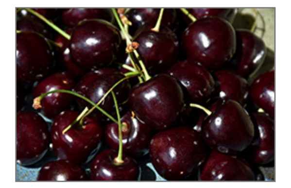
Bing Cherry fruit