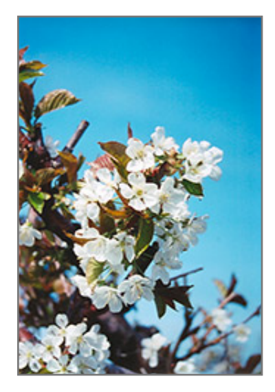
Bing Cherry flowers