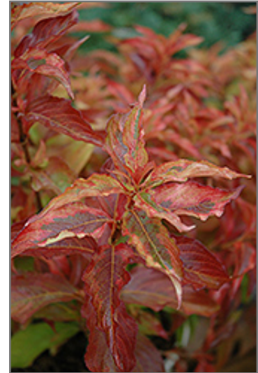
My Monet Sunset Weigela foliage

My Monet Sunset Weigela makes a fine choice for the outdoor landscape, but it is also well-suited for use in outdoor pots and containers. It is often used as a 'filler' in the 'spiller-thriller-filler' container combination, providing a mass of flowers and foliage against which the thriller plants stand out. Note that when grown in a container, it may not perform exactly as indicated on the tag - this is to be expected. Also note that when growing plants in outdoor containers and baskets, they may require more frequent waterings than they would in the yard or garden.