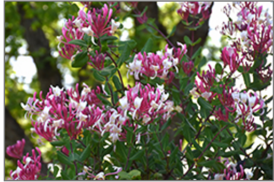
Peaches And Cream Honeysuckle flowers

Peaches And Cream Honeysuckle will grow to be about 20 feet tall at maturity, with a spread of 24 inches. As a climbing vine, it tends to be leggy near the base and should be underplanted with low-growing facer plants. It should be planted near a fence, trellis or other landscape structure where it can be trained to grow upwards on it, or allowed to trail off a retaining wall or slope. It grows at a medium rate, and under ideal conditions can be expected to live for approximately 20 years.