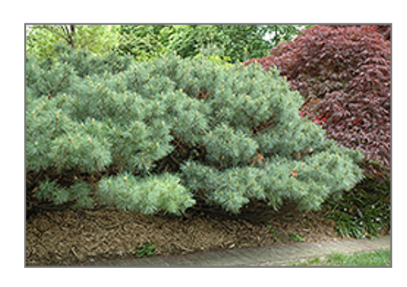
Dwarf White Pine

A high quality evergreen garden shrub with a dense, rounded habit of growth throughout its life, features silvery-blue needles; very compact and slow growing, excellent for form, texture and color detail in home gardens or for rock gardens; needs full sun