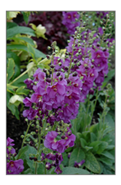
Sugar Plum Mullein flowers

A compact variety with short, well branched spikes of violet-purple blooms with dark purple anthers, rising from a tight rosette of green leaves; the smaller size makes it perfect for containers; deadheading encourages new blooms