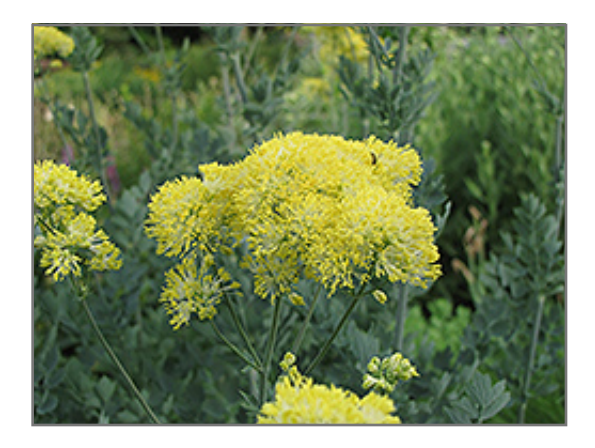
Yellow Meadow Rue flowers

This is a relatively low maintenance plant, and should be cut back in late fall in preparation for winter. It is a good choice for attracting bees and butterflies to your yard, but is not particularly attractive to deer who tend to leave it alone in favor of tastier treats. It has no significant negative characteristics.