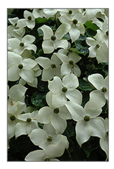
Chinese Dogwood flowers