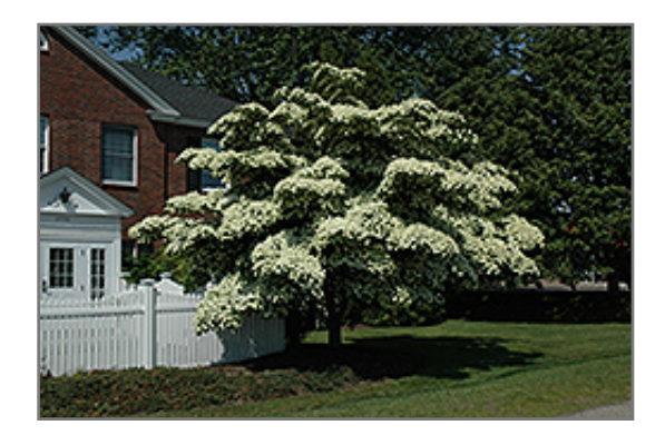
Chinese Dogwood in bloom

This is a relatively low maintenance tree, and should only be pruned after flowering to avoid removing any of the current season's flowers. It is a good choice for attracting birds to your yard. It has no significant negative characteristics.